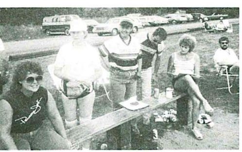
NOTE: With several close games, the first floor office team again claims victory as this year's tournament winner.